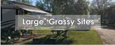
Large, Grassy Sites