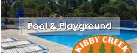
Pool & Playground